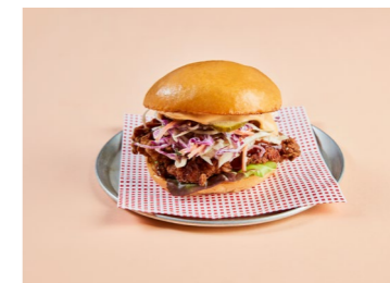
HARRY'S FRIED CHICKEN hot sauce, coleslaw, lettuce, tomato, pickles