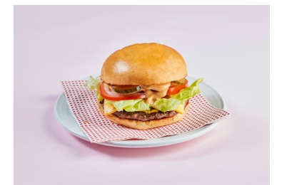
HARRY'S WAGYU BEEF cheese, lettuce, tomato, pickles, onions, harry's sauce