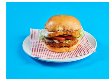
CRUMBED EGGPLANT 'SCHNITTY' v grilled haloumi, lettuce, tomato, pickles, charred onions, aioli