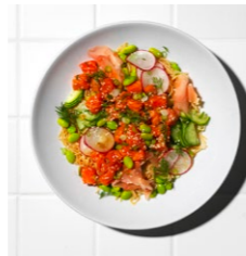
MISO SRIRACHA SALMON POKÉ BOWL

No association with pokémon, but with an ingredient list like this, you'll want to catch em all in your mouth.