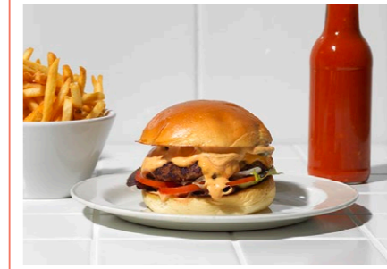
HARRY'S WAGYU BEEF

CHEESE, LETTUCE, TOMATO, PICKLES, ONIONS, HARRY'S SAUCE